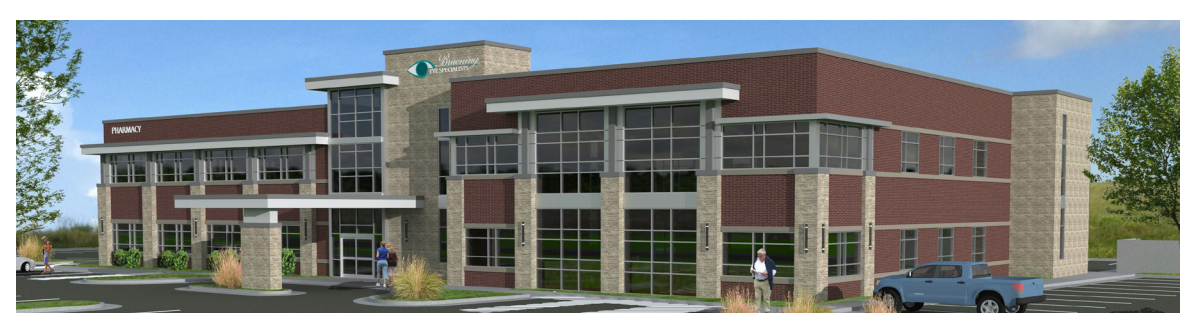
Sunnybrook Center will expand the medical campus in this growing segment of Sioux City.

As additional medical, residential, and retail opportunities take shape, Sunnybrook remains one of the most popular areas of Sioux City.