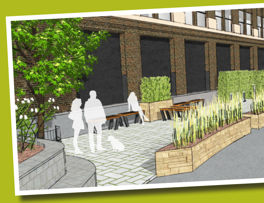
Sioux City residents weighed in on greenspace possibilities at a public open house this spring. University of Iowa students will weave popular ideas into final recommendations.