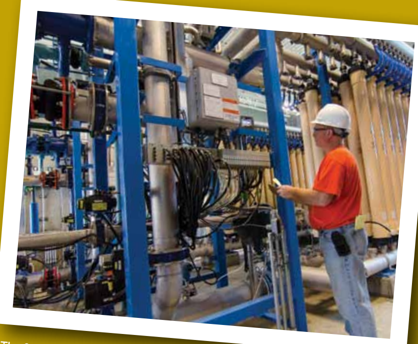
The Southbridge water treatment plant uses new technology to efficiently provide clean water.