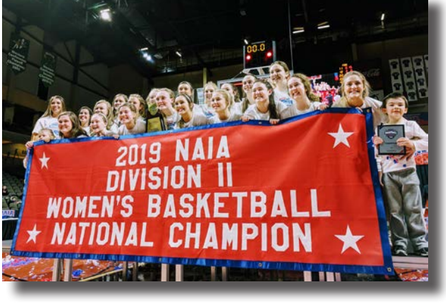
Marking a 22-year run, Sioux City is currently the longest active host of NAIA annual championships!

The National Association of Intercollegiate Athletics has given Sioux City the nod to host its women's basketball national championship in 2021—the first women's basketball championship to occur after NAIA's Divisions I and II merge in the fall of 2020.