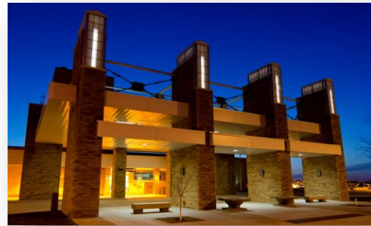
Renovated Sioux Gateway Airport Terminal

The Sioux Gateway Airport offers two concrete/asphalt runways at 9,000 feet and 6,600 feet long x 150 feet wide with full length parallel taxiways.