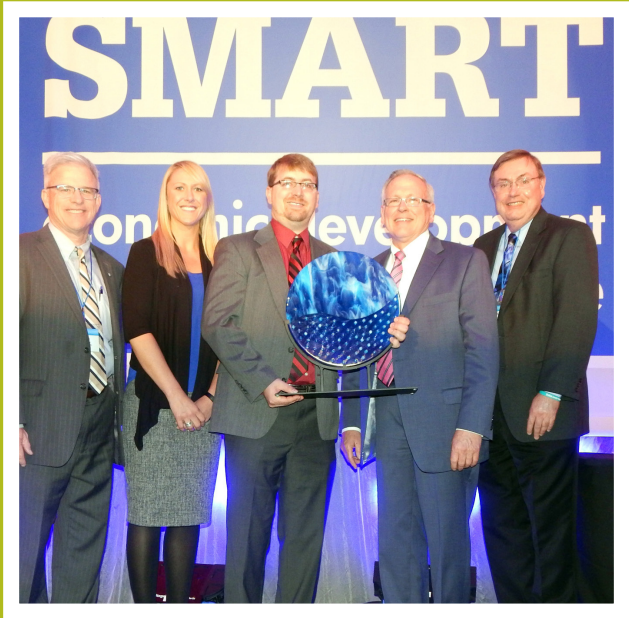
SMALL BUSINESS BOOST