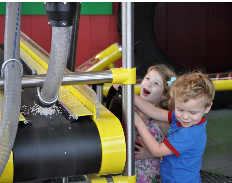
Children learn through hands-on exhibits at LaunchPAD.

Along with being a great addition to the Historic Pearl District, LaunchPAD will help attract young families to Sioux City. Supporters estimate up to 50,000 visitors to the children's museum within its first year of operation, creating an economic impact of $2 million for downtown.