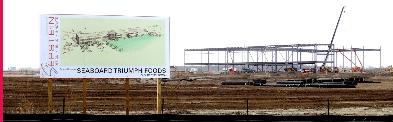
City street improvements will accommodate increased traffic flow from the Seaboard Triumph Foods project.