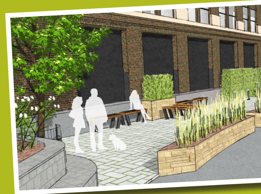
Sioux City residents weighed in on greenspace possibilities at a public open house this spring. University of Iowa students will weave popular ideas into final recommendations.