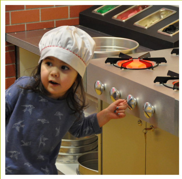
PLAY AND DISCOVERY