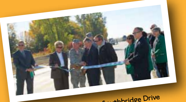
Ribbon-cutting for the new Southbridge Drive

Southbridge Drive is the latest project completed within the city's new Southbridge Business Park,